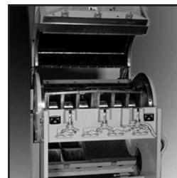
Easy access for maintenance and color changes