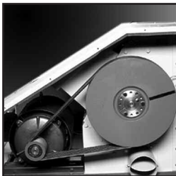
Heavy solid flywheel for added inertia